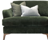
W- 114cm H- 87cm D- 103cm