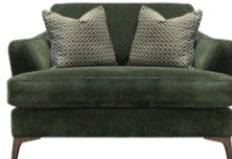
W- 132cm H- 87cm D- 103cm