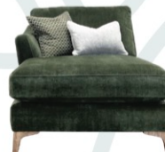
W- 100cm H- 87cm D- 161cm