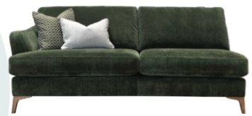
W- 202cm H- 87cm D- 103cm