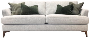
W- 220 cm H- 87cm D- 103cm