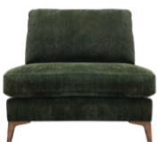
W- 78cm H- 87cm D- 103cm