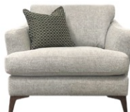
W- 98cm H- 87cm D- 103cm