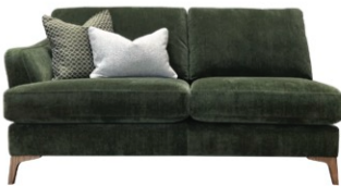
W- 177cm H- 87cm D- 103cm