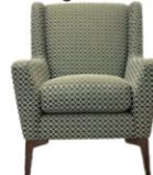
W- 79cm H- 89cm D- 89cm