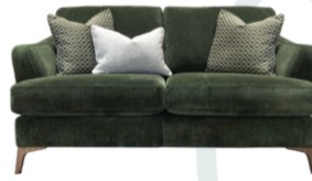
W- 170cm H- 87cm D- 103cm