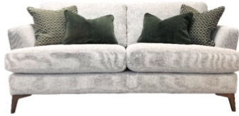
W- 196cm H- 87cm D- 103cm