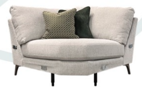
W- 118cm H- 87cm D- 118cm