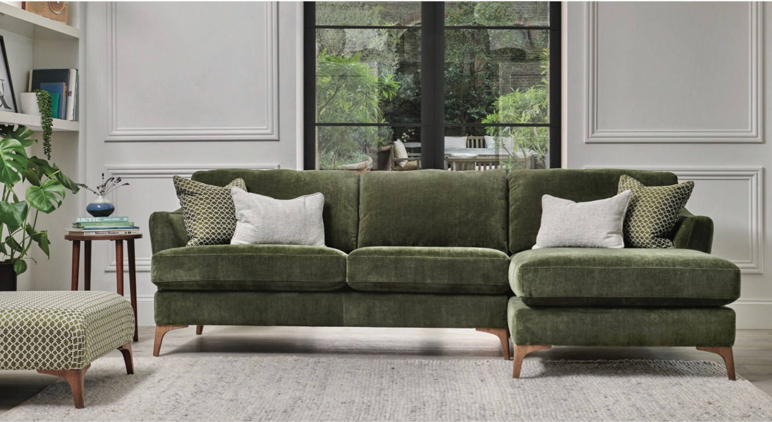
Image shows Left Hand Facing 2.5 seater with a Right Hand Facing Chaise in Manhattan Conifer with Smoke wood feet